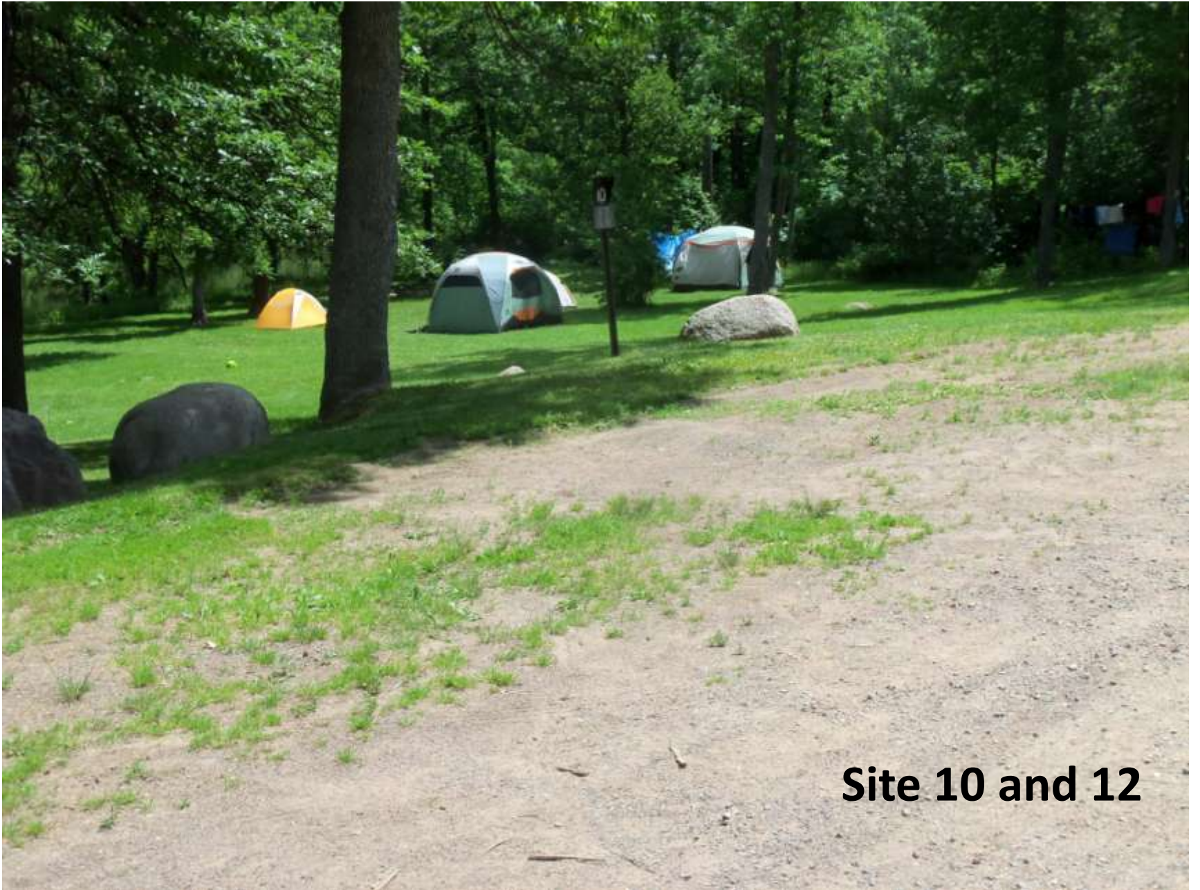
Site 10 and 12