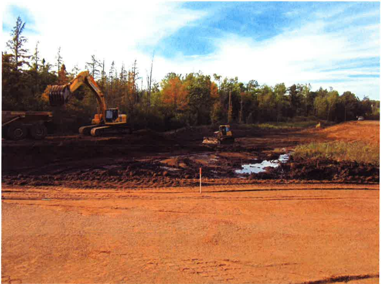
Reconstruction of the CSAH 12 – CSAH 39 Intersection