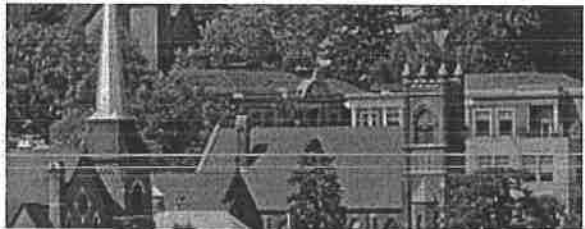
DISCOVER THE HISTORY