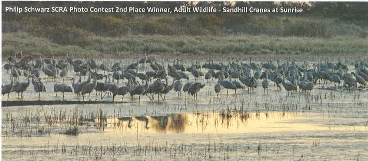
Philip Schwarz SCRA Photo Contest 2nd Place Winner, Adult Wildlife - Sandhill Cranes at Sunrise