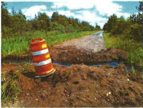
City of McCreogr—N Soo Line