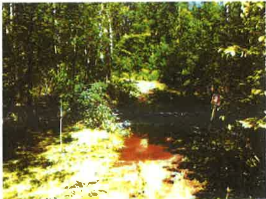
Moose River bridge—the bridge that was