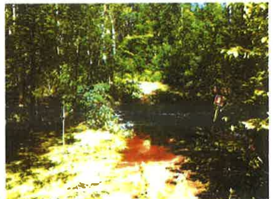
Moose River bridge—the bridge that was