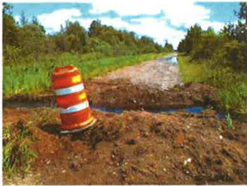
City of McGreogr—N Soo Line